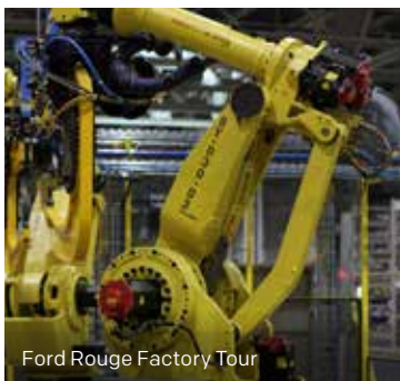
Ford Rouge Factory Tour