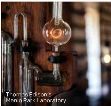
Thomas Edison's Menlo Park Laboratory