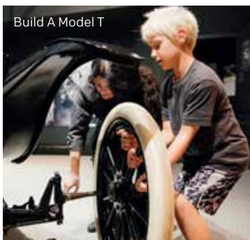
Build A Model T

It starts with curiosity. A “what if?” that turns into an idea. One spark that inspires an evolution. At The Henry Ford, stories of American ideas encourage tomorrow’s innovators to redefine what’s possible. For the innovators in all of us, The Henry Ford inspires all of us to change the world — today and tomorrow.